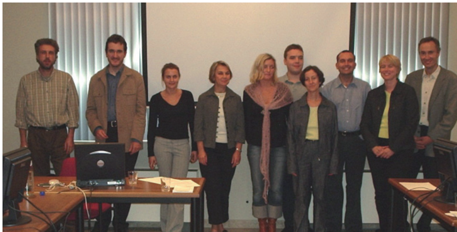
Participants at the curators training course at SSI in April 2006.

for comparison. The six database curators from AFSSA, DFVE, HPA, IP, SSI and VLA, who were chosen to take care of the quality of the central databases, perform the uniform naming and confirm the PFGE profiles submitted by partners, and perform central cluster detection of all pathogens at regular intervals.