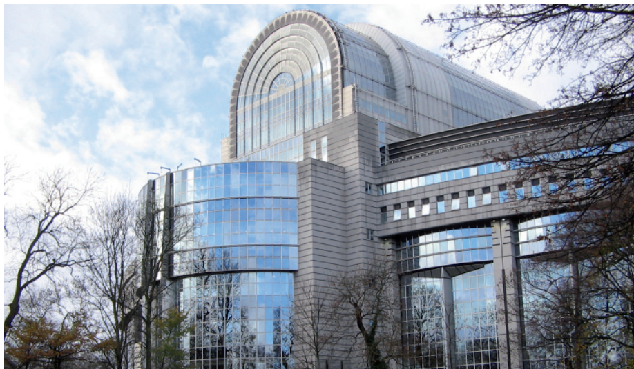
The European Parliament at Brussels: the interns met MEPs and watched the Parliament in session on the 50th Anniversary of the Rome Treaty.